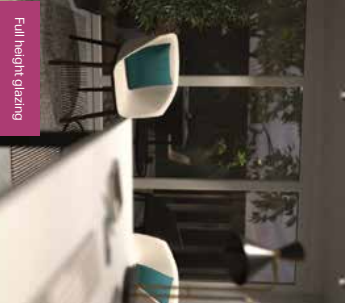
Full height glazing