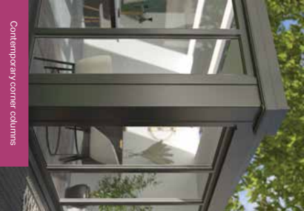
Contemporary corner columns