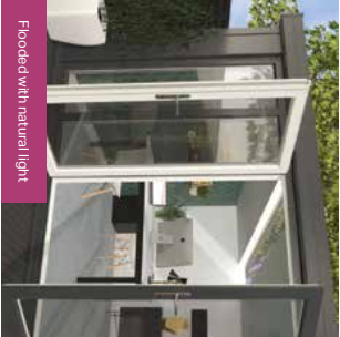
Flooded with natural light