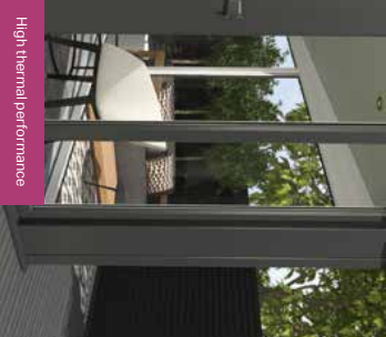
High thermal performance