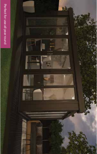
Perfect for use all year round