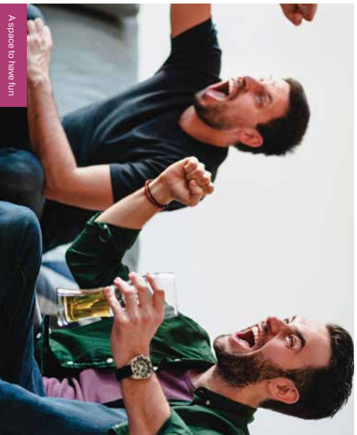
A space to have fun

High performance insulation creates a cosy space all year round that's low cost to heat, whilst the full length fixed rooflights and windows provide plenty of natural light and views of the garden. Appreciate the beauty of the outdoors and have fun in the warmth of an Ultraframe Garden Room.