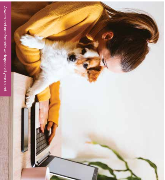
A warm and comfortable workspace all year round.

Garden Rooms by Ultraframe offer the perfect base to work, whether that be remote working, or running your own business, design studio or workshop. Providing a warm and comfortable workspace all year round, they are also very efficient to run. Our range of floorplans give you plenty of options for break-out areas and co-working.