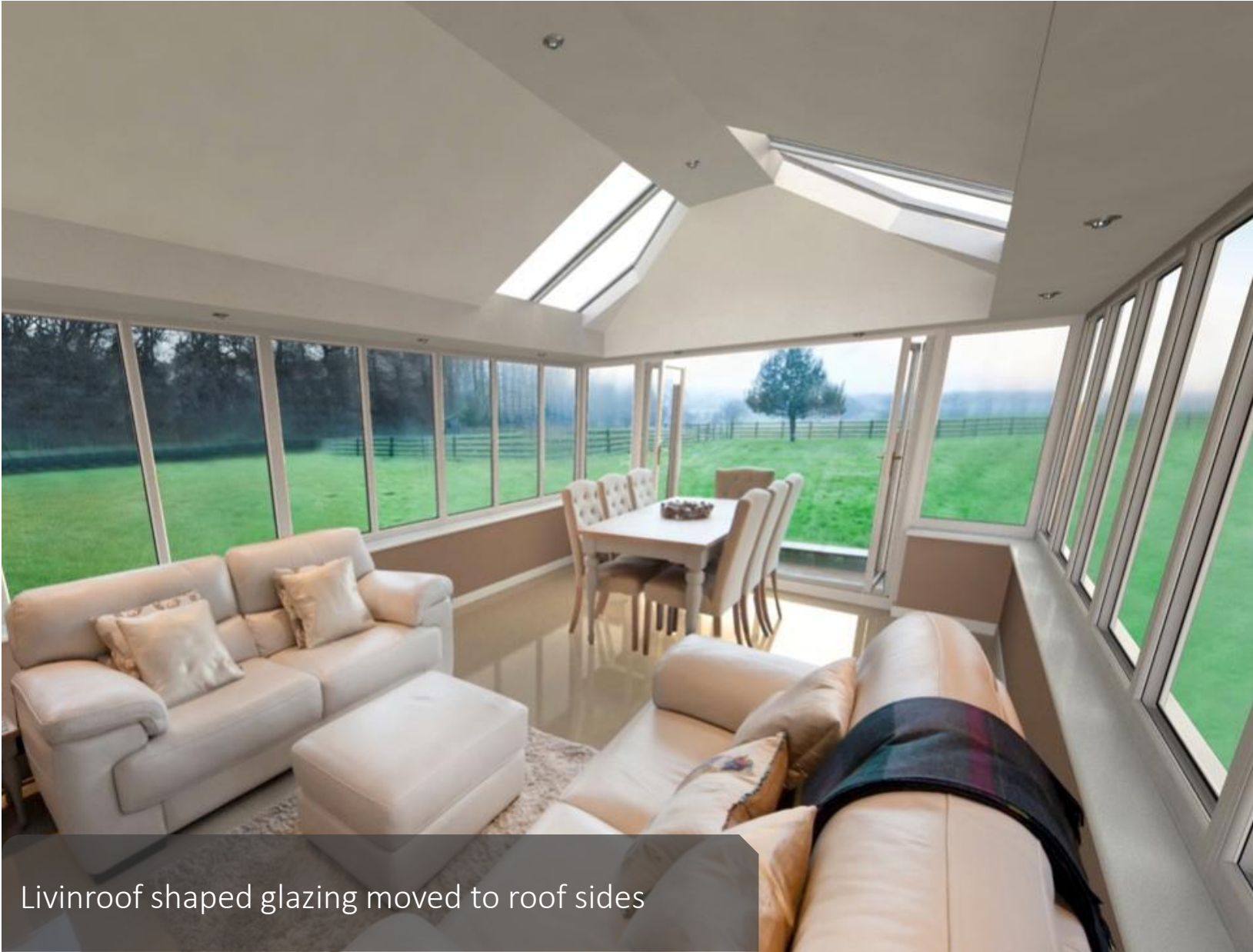
Livinroof shaped glazing moved to roof sides