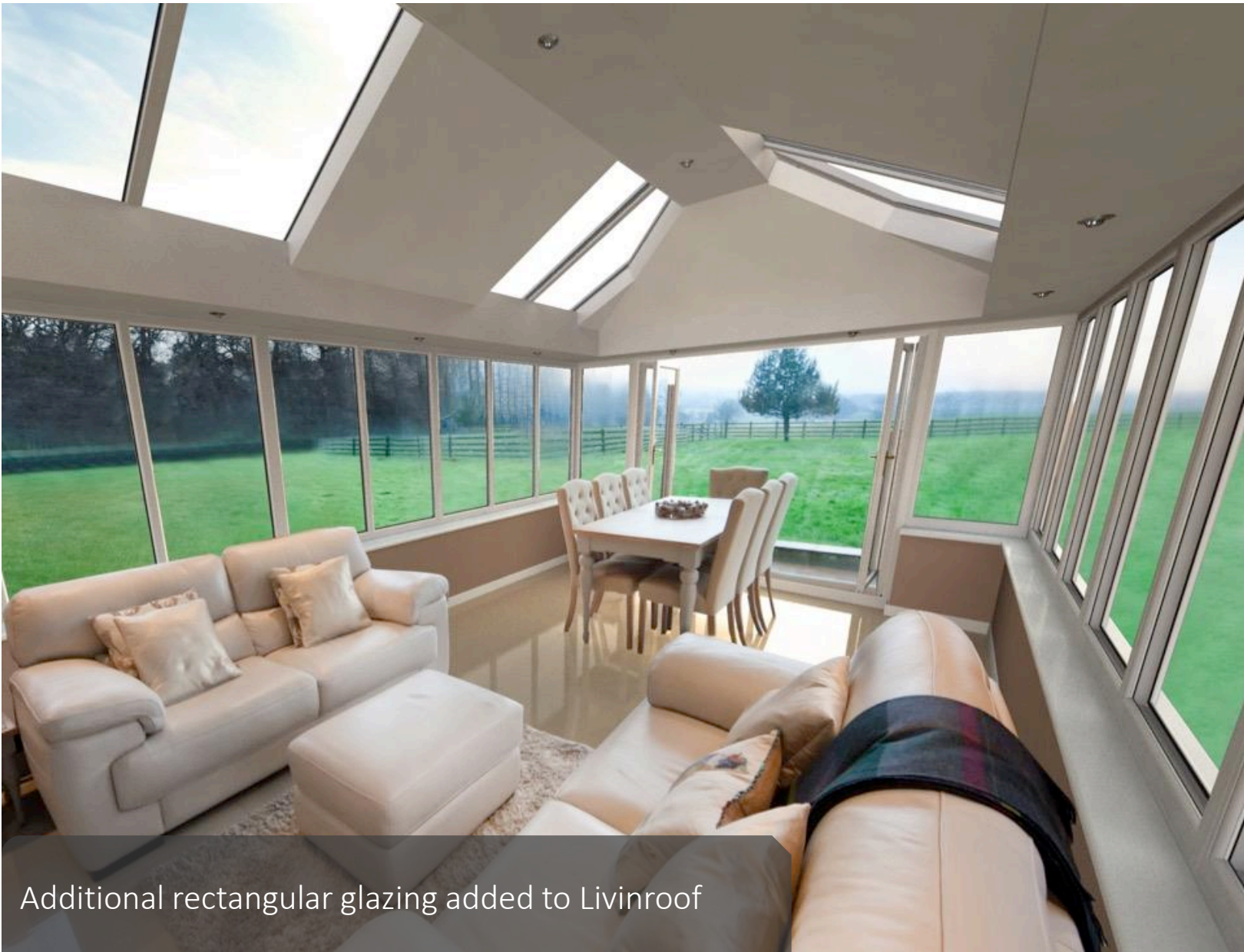
Additional rectangular glazing added to Livinroof